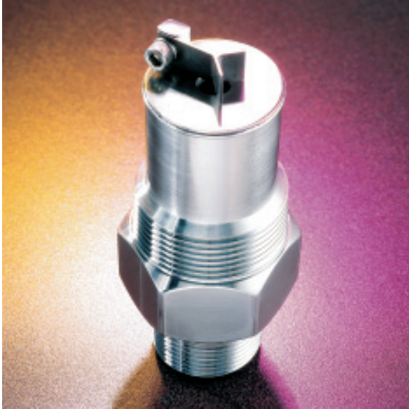
The SPC/L 301 is one of the industry's most accurate and reliable process viscometers.

FOR VISCOSITY MEASUREMENTS FROM 0.2 TO 20,000 CENTIPOISE